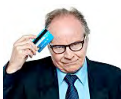
Seriously, If You Have Excellent Credit And Don't Have One Of Th...