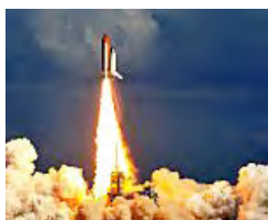
The Secret To Entrepreneurial Success