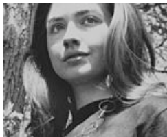
20 Celebrities Who Shockingly Used To Be Hot Answers