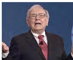
Warren Buffett Reveals How Anyone With $40 Could Become A Milli... The Motley Fool