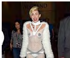
Miley Cyrus' Ridiculous Outfit Leaves Nothing to the Imagination (P... Tasty Articles