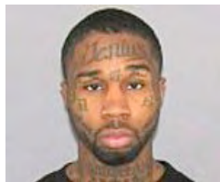
Jesus Take The Wheel: The World's Most Ratchet Face Tattoos Bossip