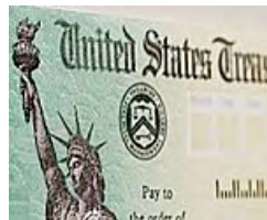
Homeowners Are In For A Big Surprise... Smart Life Weekly