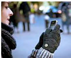
Gifts for Bratty Teens: 13 Presents for Kids Who Hate Everything RetailMeNot