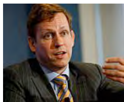
Peter Thiel's Secret to Tech Investing Crowdability