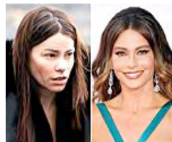
30 Shocking Pictures of Celebrities Without Makeup CelebrityToob