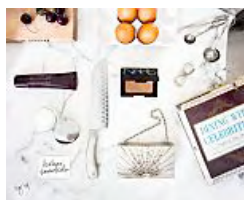
9 Summer Hostess Beauty Essentials VioletGrey.com