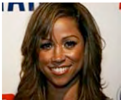
We're Done: Celebrities We Lost Respect For In 2012 Madame Noire