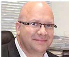
Pastor Mocked for His 'Biblical Money Code,' Gets Last Laugh Moneynews