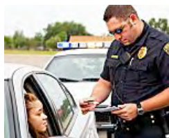
(SEP 2014) New Rule Leaves Drivers Furious & Shocked Provide-Insurance