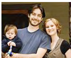
Simple Way to Pay Off Your Mortgage LendingTree